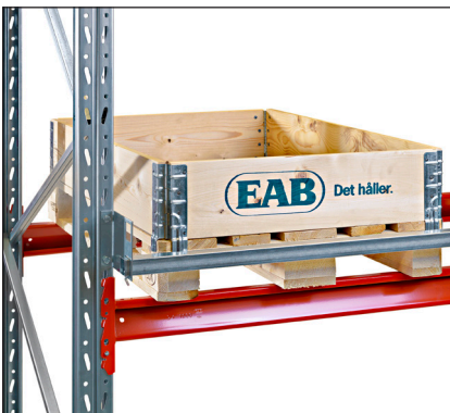
Pallet stop horizontal - prevent pallets from being placed to far in.