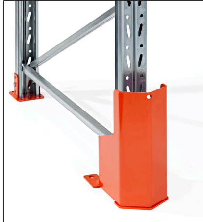
Upright protector height 400 mm with PU-spring - to be fitted on floor.