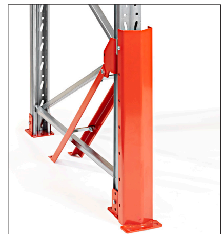
Upright reinforcement 90/110 high mod front - to be fitted in front of the upright. Provides the best possible protection for the most exposed part of the frame. Height 760 mm.