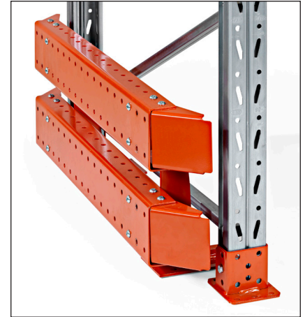
Frame protector height 400 mm - for outer frame uprights and truck aisle. For both single and double racking.