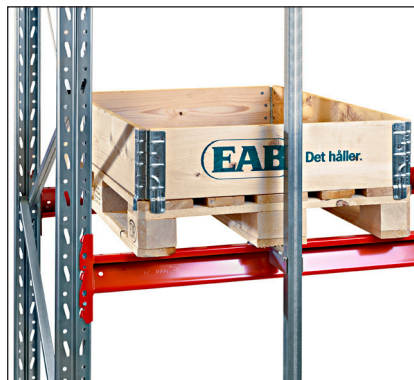
Pallet stop vertical - prevent pallets from being placed to far in.