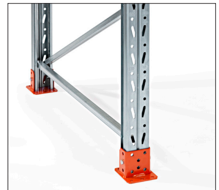
Sleeve footplate - provides very good floor fixing and protects the lower end of the upright.