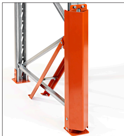
Upright reinforcement 90/110 high mod - to be fitted with the sleeve footplate. Provides the best possible protection for the most exposed part of the frame. Height 760 mm.