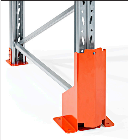
Upright protector height 400 mm - to be fitted on floor.