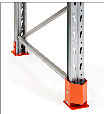
Upright reinforcement 90/110 low mod. - to be fitted together with the sleeve footplate. Provides excellent protection for the upright frame member, without taking up extra space. Height 150 mm.